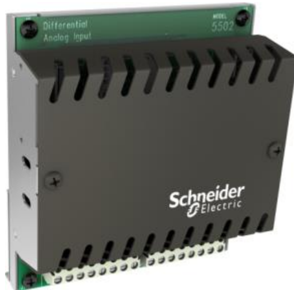
Figure 1: 5502 Differential Analog Input Module

Inputs are fuse and transient protected and optically isolated from the main logic power and the other analog inputs.